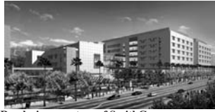
Rendering courtesy of SmithGroup